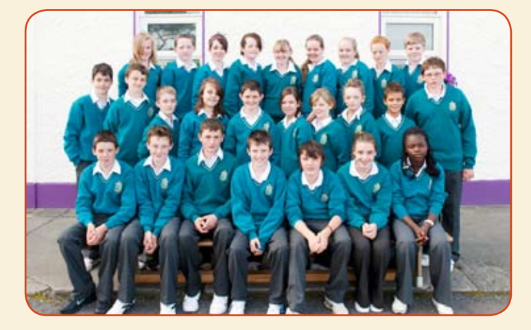
Pictured are the 1st year students from Sancta Maria College